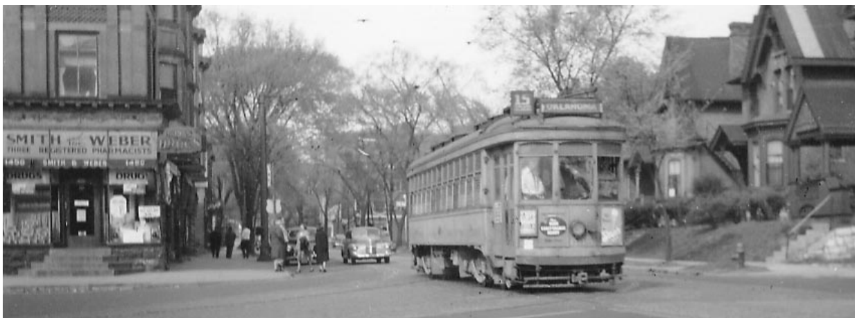
The route 15 streetcar rumbles south on Farwell Ave ready to turn west on Brady Street.