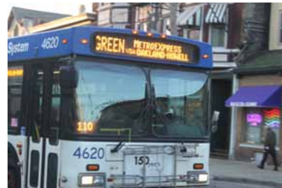
The Green Line links Bayshore and Mitchell International with Brady Street somewhere in between.